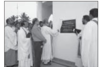
Dedication of the new vault at cemetery