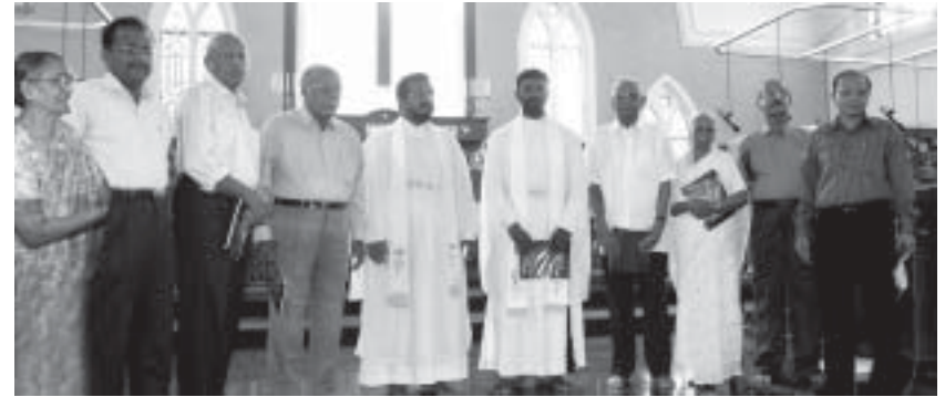
Centenary Souvenir release function

It also serves as a reference guide for those who want to know more about the CSI Immanuel Church.