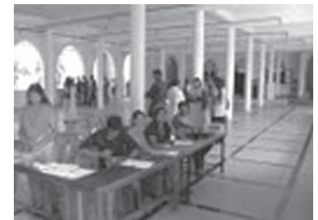
Registration to the Youth Regional Conference in progress ...

The youth of our church meet after the Malayalam service on the 2nd and 4th Sunday of every month. We invite all our youth to participate in the fellowship. A joint meeting of the youth fellowship and family-care fellowship gathered in the Chapel on 20th of September 2009 for the preparation of the 46th Trichur Regional Youth Conference.