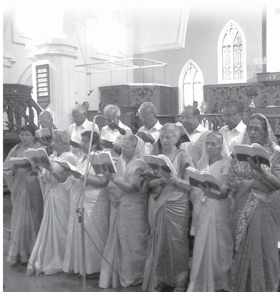
Our senior friends of Immanuel Church rendering a special song during worship on Senior Citizen's Sunday.